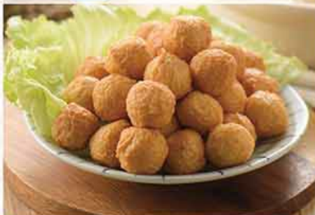
黃金魚蛋 Golden fish eggs 5台斤/包 3000g/pack 約12g/pcs 12個月 冷凍