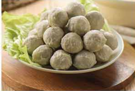
虱目魚丸 Milkfish meatball 5台斤/包 3000g/pack 約12g/pcs 12個月 冷凍