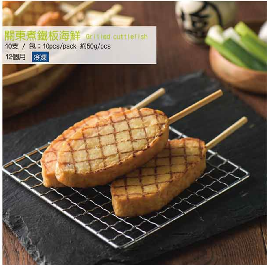
關東煮鐵板海鮮 Grilled cuttlefish 10支 / 包 : 10pcs/pack 約50g/pcs 12個月 冷凍