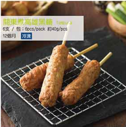
關東煮高雄黑糖 Tempura 6支 / 包 : 6pcs/pack 約40g/pcs 12個月 冷凍