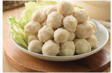
特製花枝丸/花枝丸 Squid meatball 5台斤/包 3000g/pack 約10g/pcs (20g/pcs) 12個月 冷凍