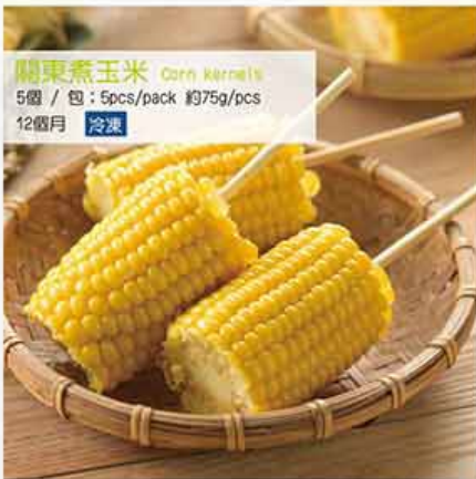
關東煮玉米 Corn kernels 5個 / 包 : 5pcs/pack 約75g/pcs 12個月 冷凍