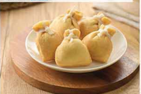
飛魚卵福袋 Tobiko-stuffed tofu pockets 5台斤/包 3000g/pack 約30g/pcs 12個月 冷凍