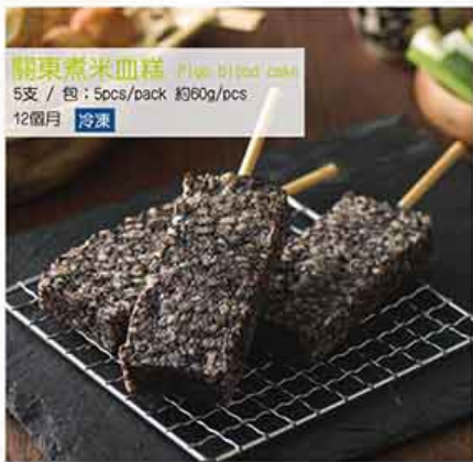
關東煮米血糕 Pig blood cake 5支 / 包 : 5pcs/pack 約60g/pcs 12個月 冷凍