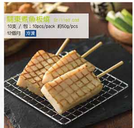
關東煮魚板燒 Fish board 10支 / 包 : 10pcs/pack 約50g/pcs 12個月 冷凍