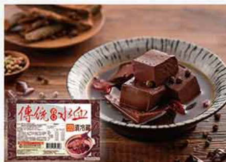
傳統香Q水血 Pig blood Curd 2塊 / 盒 : 2pcs/pack 約140g/pcs 2個月 冷藏