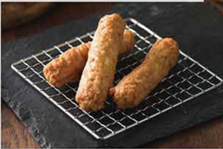
高雄黑輪 Tempura 5台斤/包 3000g/pack 約40g/pcs 12個月 冷凍