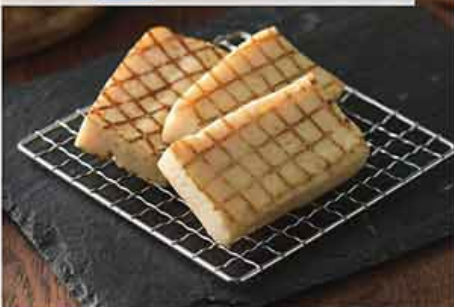
魚板燒 Grilled cod 5台斤/包 3000g/pack 約60g/pcs 12個月 冷凍