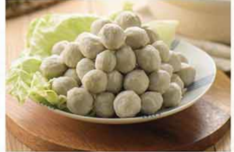
珍珠虱目魚丸 Milkfish meatball 5台斤/包 3000g/pack 約5g/pcs 12個月 冷凍