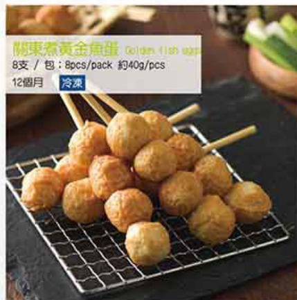
關東煮黃金魚蛋 Golden fish eggs 8支 / 包 : 8pcs/pack 約40g/pcs 12個月 冷凍